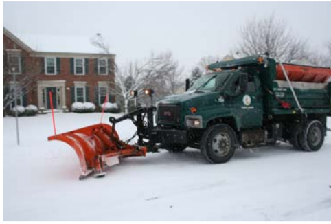
In both the rural and suburban areas, dump trucks plow and spread salt.

Public Works outfits pick-up trucks with a plow and salt spreader to clear cul-de-sacs and other side streets. Four-wheel drive is a necessity to navigate some of Boone County's hills.